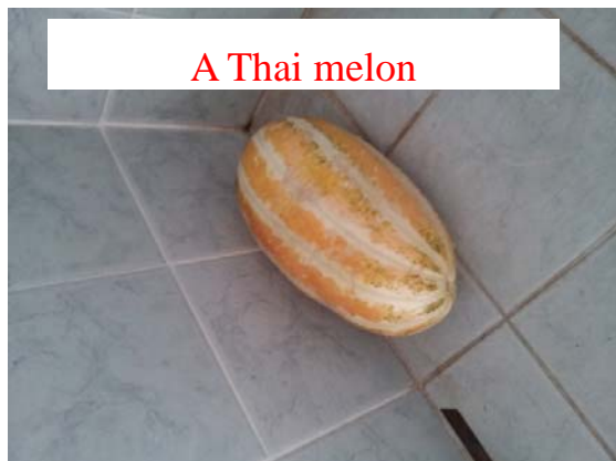
A Thai melon