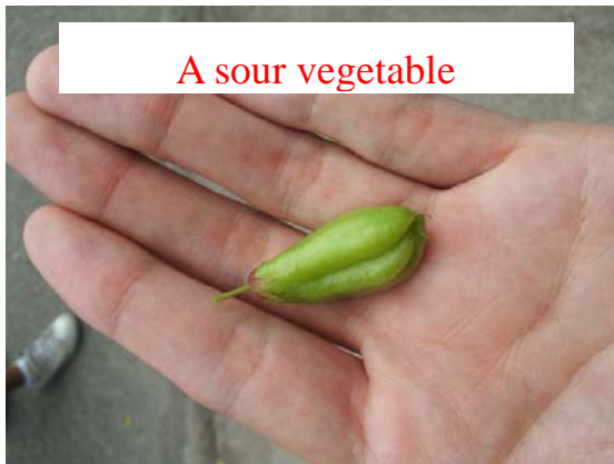
A sour vegetable