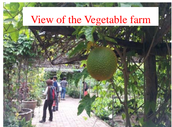
View of the Vegetable farm