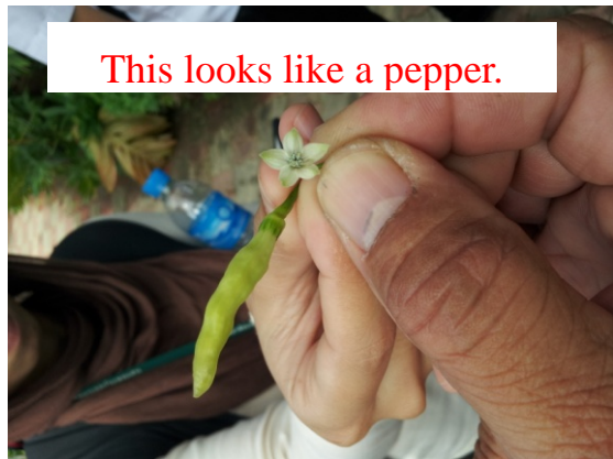
This looks like a pepper.