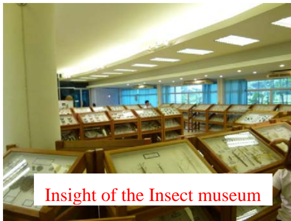
Insight of the Insect museum