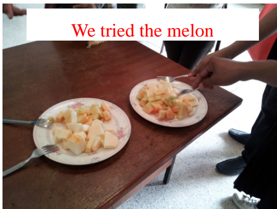
We tried the melon