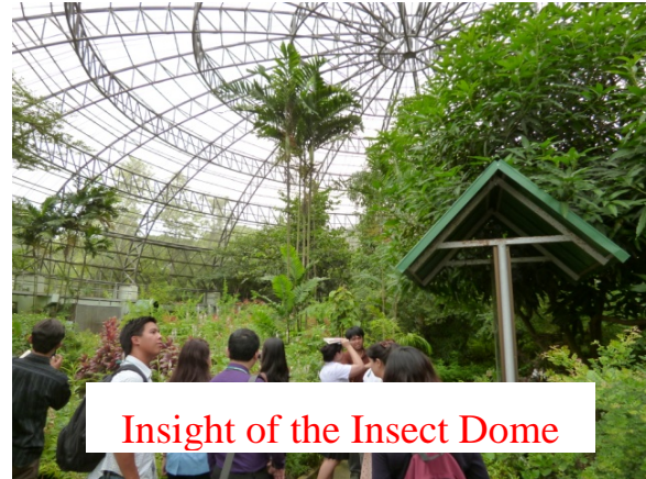
Insight of the Insect Dome