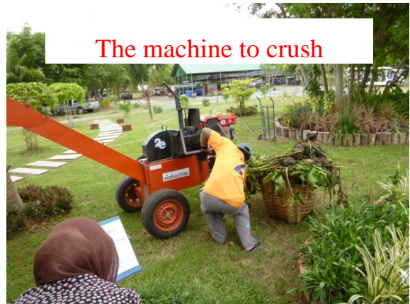
The machine to crush