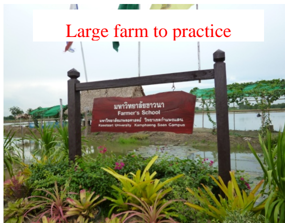
Large farm to practice